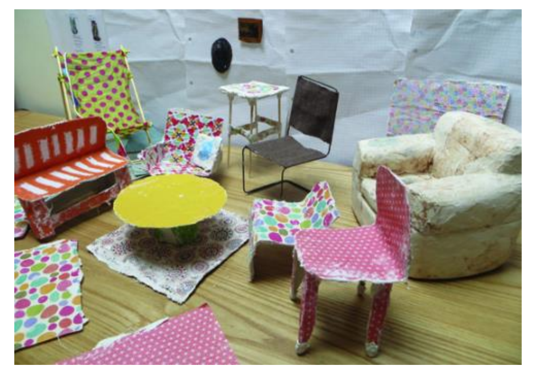
So, 'Take a Seat' and discover what you can do......