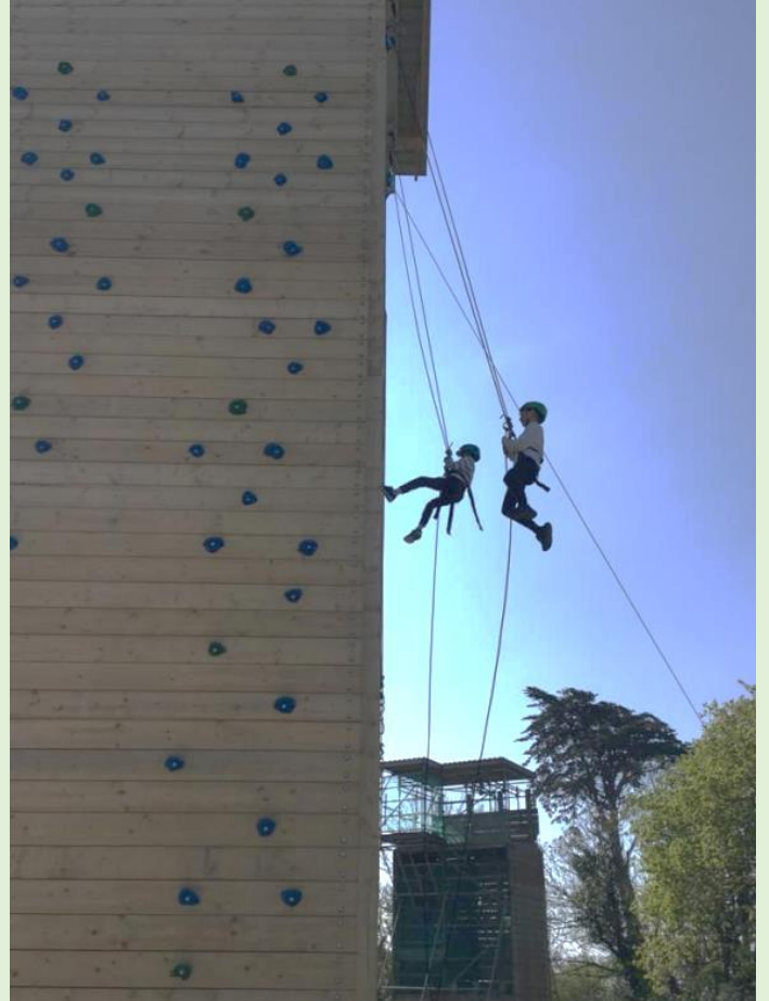
Balancing up high and abseiling to the ground