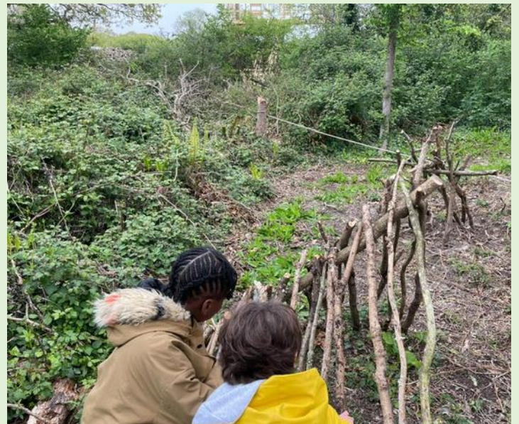
Into the woods to practise bushcraft skills