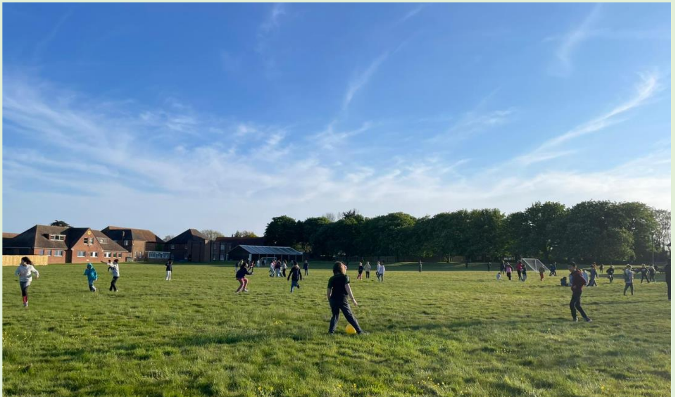
Time to play outside (even before breakfast)