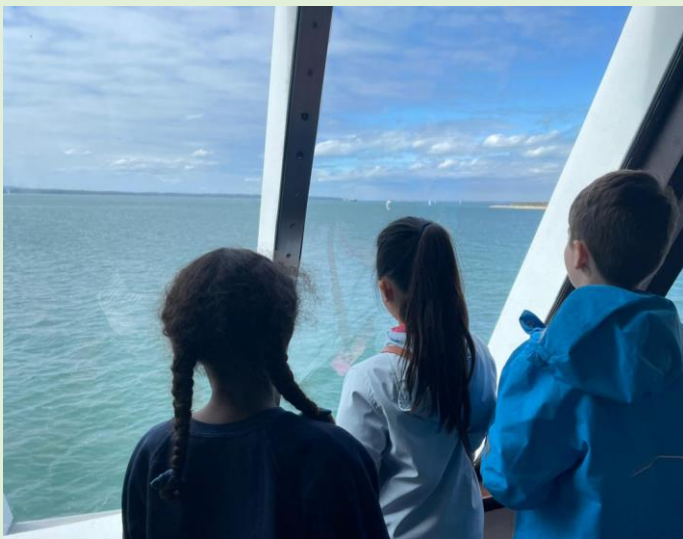
A journey across the sea

Thank you to all the staff for taking 115 children on a great adventure and making a truly memorable 3 days possible.