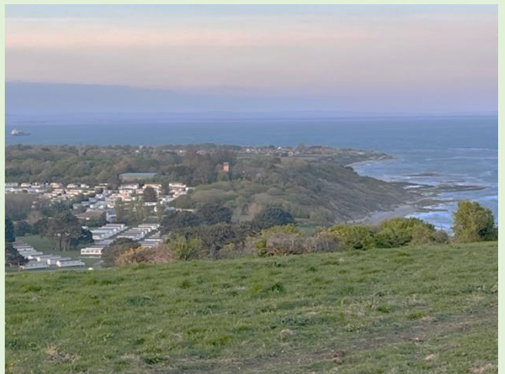
Walks in nature