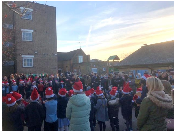
Year 2 @ Webb's