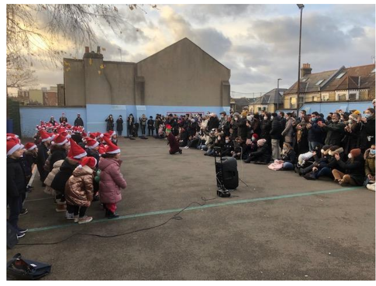
Year I @ Webb's

Well done to the children, to the adults for joining in and to the PTA for the festive hats for every child.