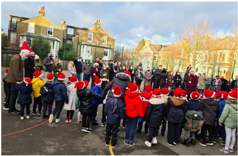
Years 1 & 2 @ Meteor