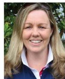
Ms Ounyemi PE Teacher

The UEFA Women's Euro football is taking place this summer with matches being held in London - good luck England women!