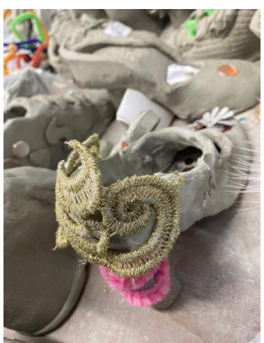
4. Leave to dry

More photos to come of the finished products . . .