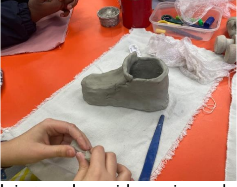
2. Join together with scoring and slip