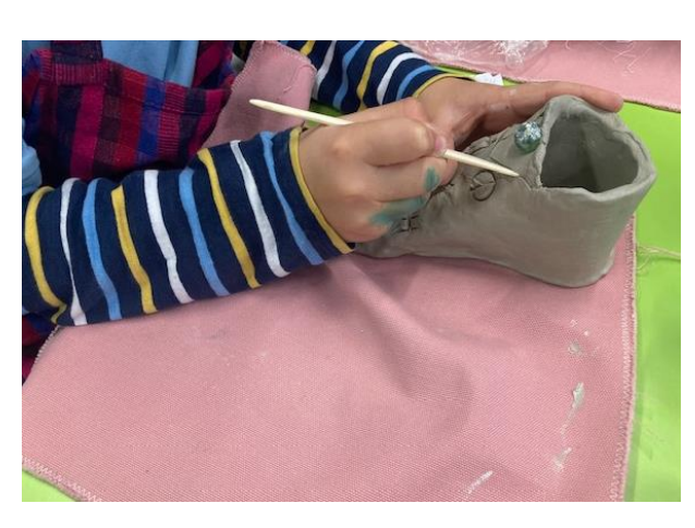
3. Embellish your design