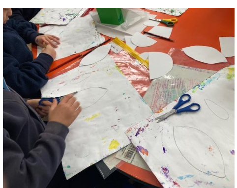
2. Cut out shapes