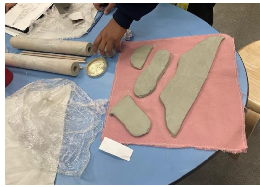
I. Roll out clay and cut out pieces