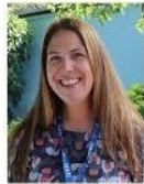
Lucy Cliff Nursery