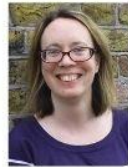
Clare Trotter Nursery